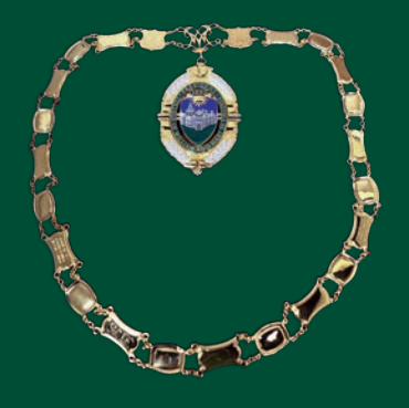
PRESIDENT'S BADGE & CHAIN