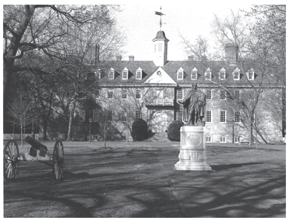
Sir Christopher Wren Building

The Historic Campus is the site of three restored pre-Revolutionary buildings. The Sir Christopher Wren Building (1695, restored 1928-31), still in daily classroom use, is the oldest academic building in the United States. The Brafferton (1723, restored 1932), originally a school for Indians established with a bequest from the English scientist Robert Boyle, today contains administrative offices. The third building, the President's House (1732, restored 1931), has served as home for each of the twenty-five presidents of the College.