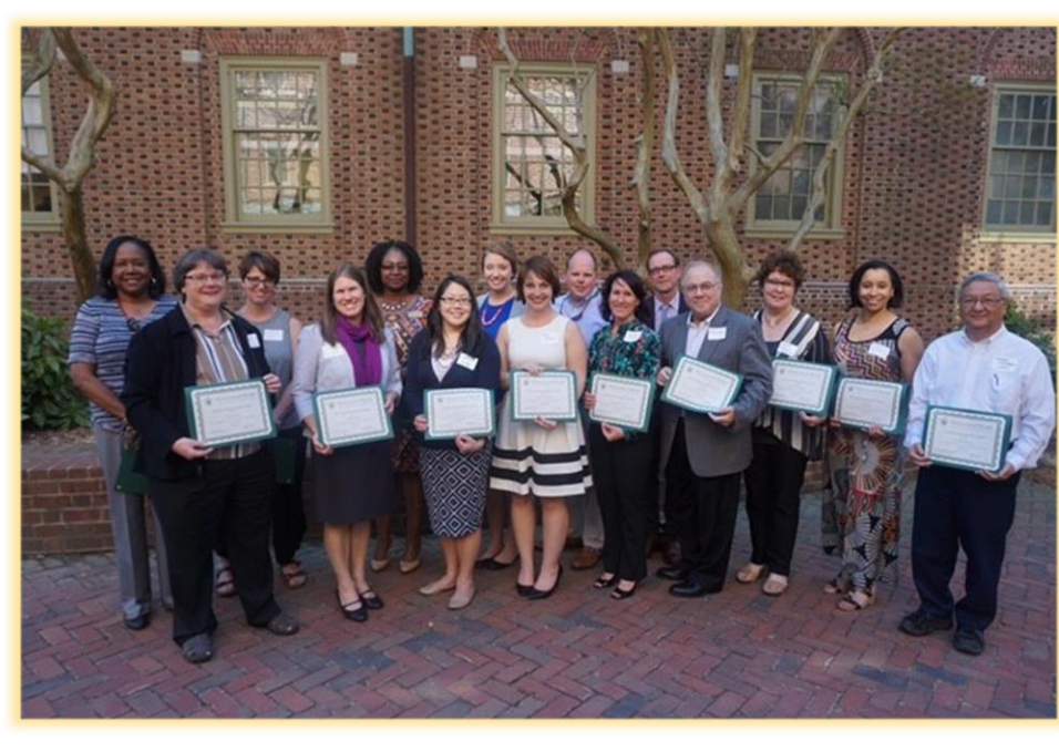
2015-16 certificate recipients

If you would like to nominate a colleague for outstanding efforts in furthering diversity on our campus, please go to forms.wm.edu/26808