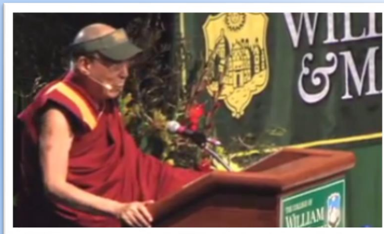
His Holiness the 14th Dalai Lama delivered a speech on compassion at William & Mary on October 10, 2012.