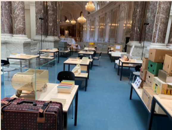
Inside the HdGÖ

He worried: had enough changed. I worry the same too.