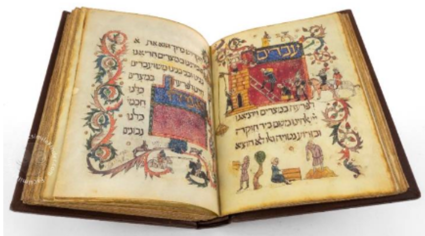
Figure 1: Modern Reproduction of the 14 th century Haggadah of Barcelona

seen in texts such as the Barcelona Haggadah dating from the mid-14 th century prior to the total Christian reconquest of the peninsula. In the years following the conquest of the Iberian Peninsula by Tariq of the Umayyad Caliphate in 711 the Jewish