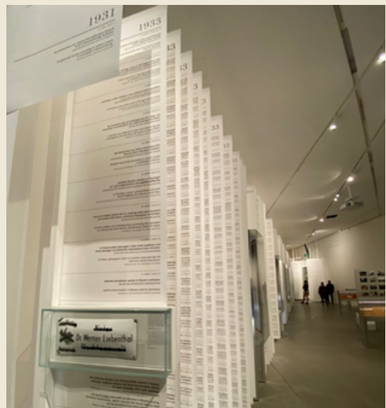
Anti-Jewish laws displayed at the Jüdisches Museum