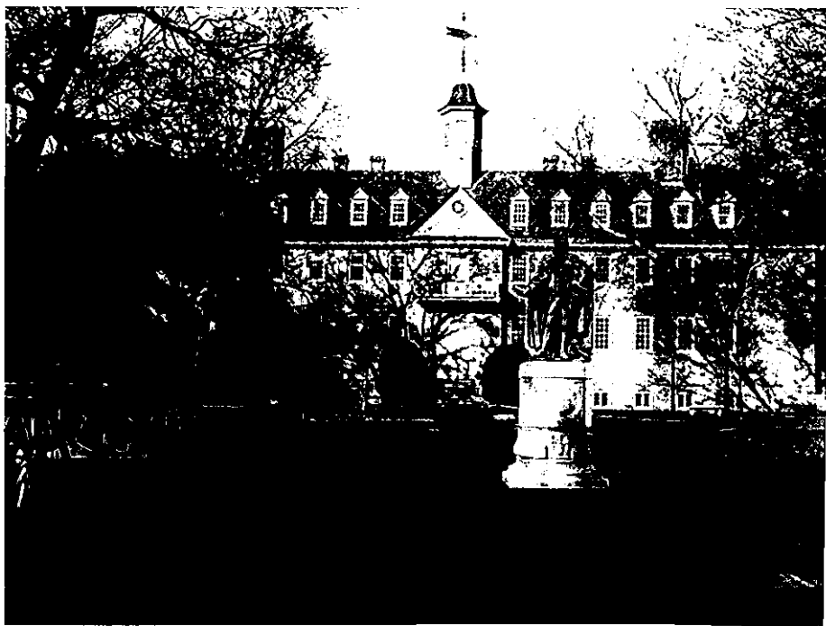
Sir Christopher Wren Building

The Historic Campus is the site of three restored pre-Revolutionary buildings. The Sir Christopher Wren Building (1695, restored 1928-31), still in daily classroom use, is the oldest academic building in the United States. The Brafferton (1723, restored 1932), originally a school for Indians established with a bequest from the English scientist Robert Boyle, today contains administrative offices. The third building, the President's House (1732, restored 1931), has served as home for each of the twenty-five presidents of the College.